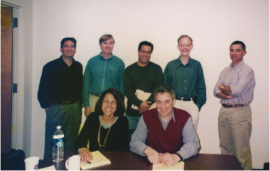
UCLA Space Simulation Group

of magnetic field and acceleration of charged particles. Sagdeev, then, was a very young director and everybody hoped he would continue to be one for, at least, another 30 years, which was customary back then.