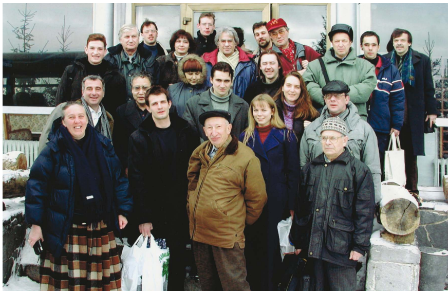
INTERBALL team meeting, Sofia, 2002