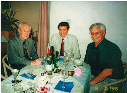
With two most famous space physicists Eugene Parker and Ian Axford

In the field of space plasma we are planning one more project called RESONANCE, expanding the INTERBALL ideas — i.e. multi-probe plasma measurements. RESONANCE is also a multi-satellite system, which is going to work much closer to the Earth and explore the regions of the near-Earth space where the hot plasma meets the cold one. It's a work in progress not without difficulties, as well. At first, we wanted to build two large