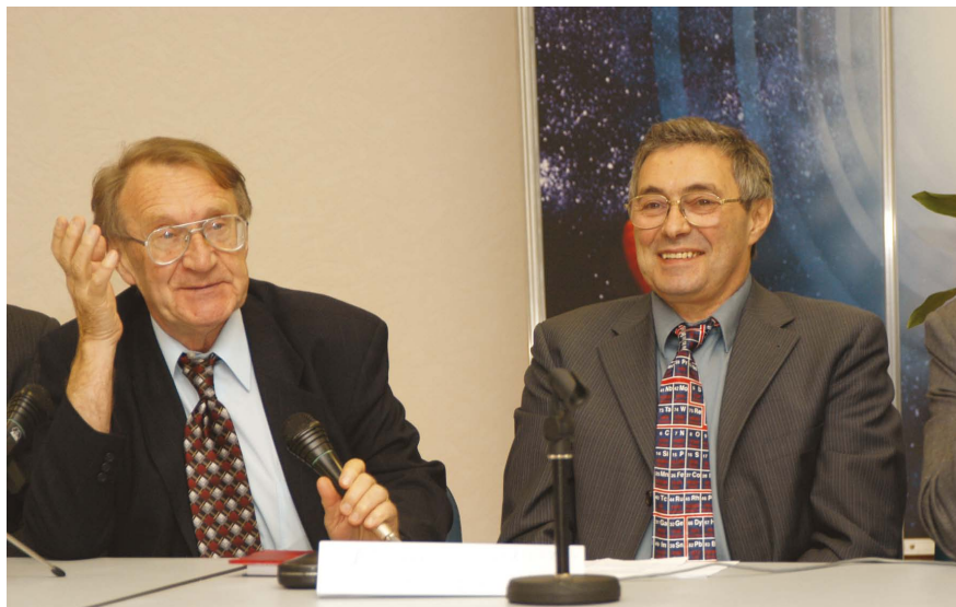
With Roald Sagdeev, the director of IKI in 1973-1989

At the beginning, the Institute was not really ready to accomplish its difficult mission. All the different people, who came to work here, brought their old ways and traditions with them. It was very counterproductive, all different ways of thinking created conflicts, so the “melting pot” was not exactly happening. When I came here as a student in 1969, I was astonished by how divided the place was, every group played their own political games, and there was this constant fighting — everybody against everybody else.