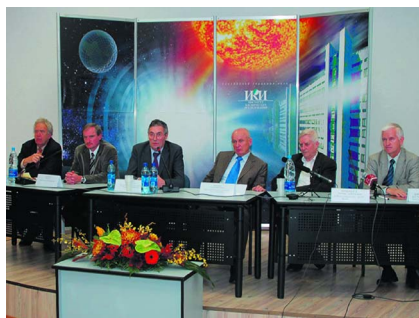
Space Science Days at IKI