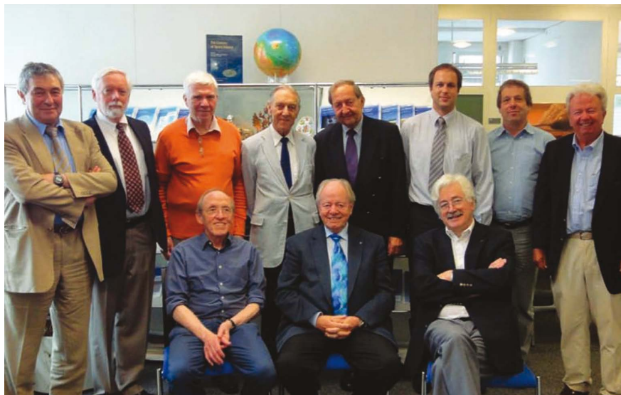
International Space Science Institute is very important part of my scientific life since 1996. Member of the board since 2003

I am glad to see that a lot of young people came to work here and the average age of the scientific staff is lowering. In science the early stage of scientific career is very important and often their best results scientists produce before forty. I was the youngest director in our Physical Division of the Academy and also became later the youngest academician for a moment.