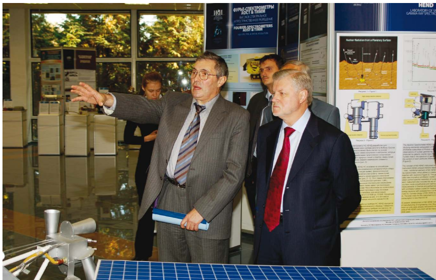
With Sergey Mironov – chair of the State Duma near the mockup of Phobos spacecraft. IKI, 2007

Now, we are fighting for our field not to suffer much loss under the circumstances, but I must admit “Roscosmos” is doing its part in order to help us to succeed.