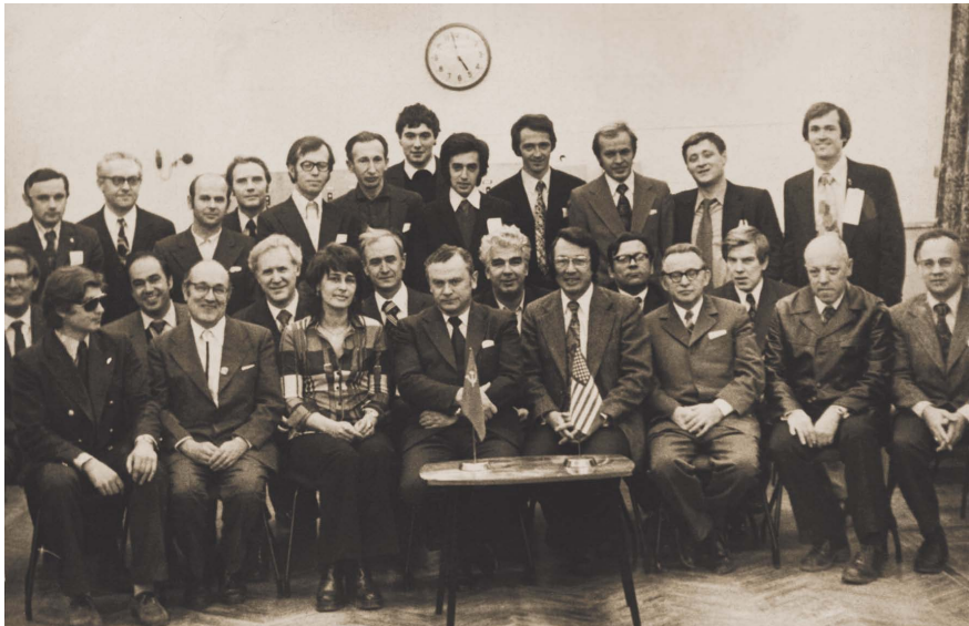
First symposium on, solar wind interaction with planets, 1975, Moscow

I wanted to leave for Lebedev Physical Institute of the Academy (FIAN) or Sternberg Astronomical Institute (at the Moscow State University) where they had the space physics departments, but it didn’t worked out that way. It was not advisable to students to go where there