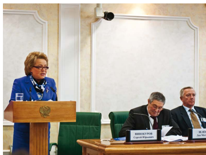
Meeting at the Russian parliament. Chair of the Federation Council Valentina Matvienko on the left