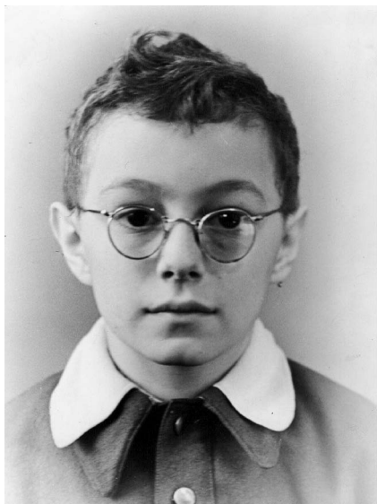
At school my nickname was 'Professor'

I began attending evening math classes for gifted school children at the Moscow State University, and unlike school studies, the math class was very interesting, indeed, so, soon I gave up all of my street endeavours altogether. After I finished the 8 th grade I decided to apply to a specialist math school. There were several prestigious math schools in Moscow. One was in Izmailovo (the district at the far east of Moscow) — №444, another one in the centre near the “Moscow” department store, but I was mostly interested in №7, which was founded by Andrei Kolmogorov.