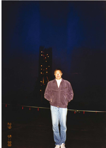
Plesetsk. INTERBALL launch

We were decidedly lucky. The INTERBALL was launched in summer. In the fall of the same year, the project MARS-96 was about to be launched as well. I remember that day in November very well. I didn't go to the launch since I was not directly involved in the project, I went to the Mission Control Center, instead. I had a very bad feeling that morning. Somebody even asked me — “Why so glum at such an event?” MARS-96 was a huge apparatus filled with many complex devices and instruments, our industry doesn't make anything like that anymore.