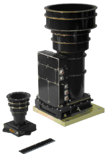
Fig. 1. Photos of star trackers (right – BOKZ-M60/1000, left – MicroBOKZ on CMOS)