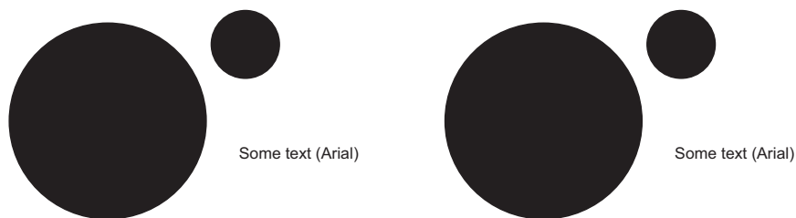
Figure 2: The same as in Fig. 1 (but prepared in psfig package).