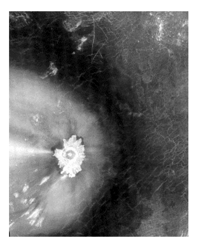
Fig.1 Parabolic feature around crater Adivar on Venus : the parabola, formed by exoatmospheric dispersal of material in the expanding ejecta plume is several hundred km across – intermediate in size between the north and south polar residual ice caps on Mars.

On Earth, an event needs to be energetic enough to form a crater about 10 km in diameter (and the Ivory Coast microtektite field is associated with the 12km Bosumtwi crater, as an example). In Mars' thin atmosphere, the corresponding threshold size is only about 2.5 km (or a 150m diameter impactor, with a velocity of 10 km/s) : thus atmosphere-piercing events are relatively common on Mars compared with Earth or Venus.